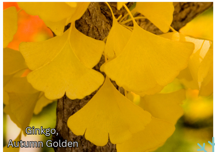
Ginkgo, Autumn Golden